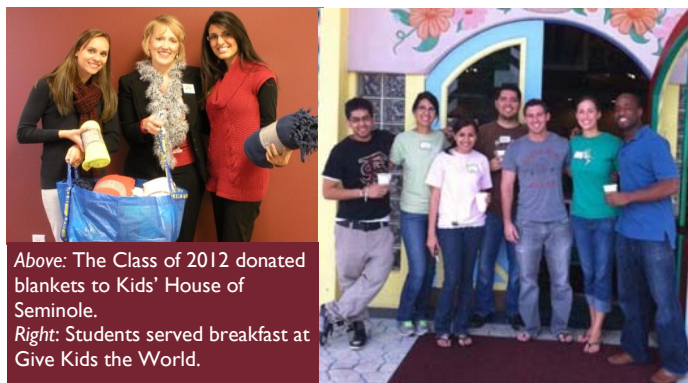
Above: The Class of 2012 donated blankets to Kids' House of Seminole. Right: Students served breakfast at Give Kids the World.